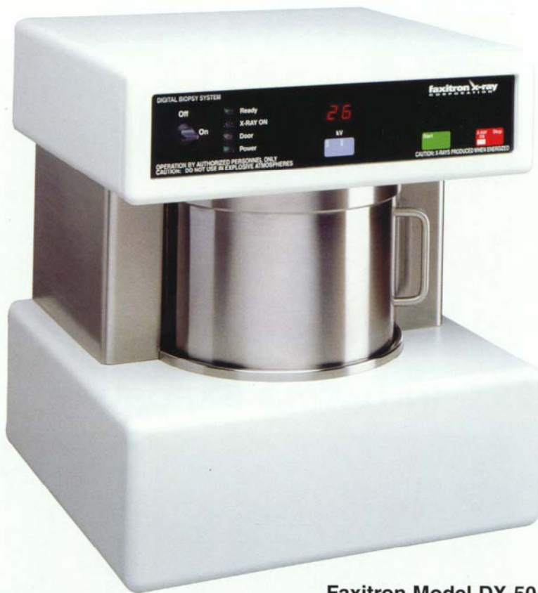
Faxitron Model DX-50