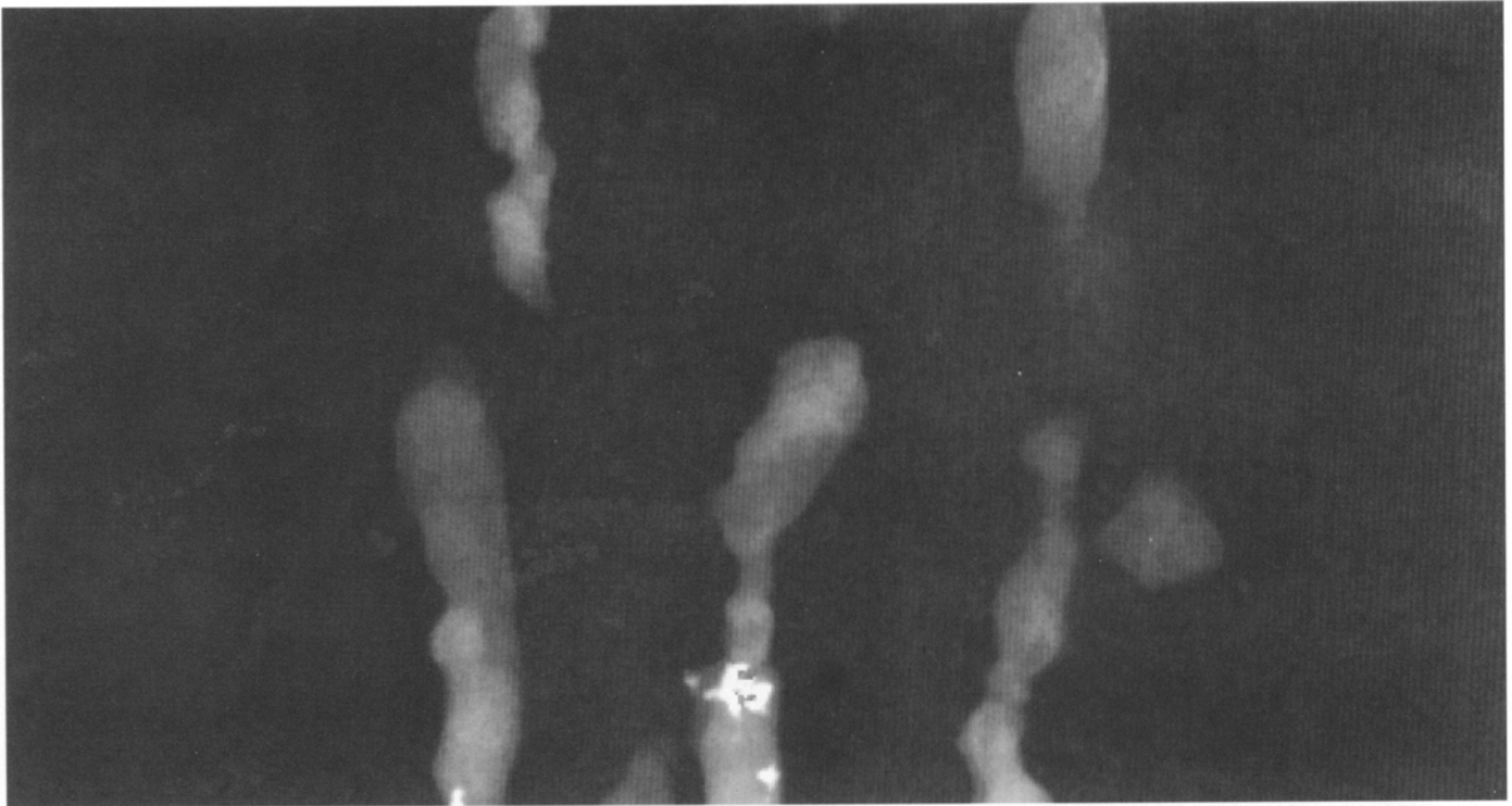
Large Core Needle Biopsy: Greater than 3 times magnification of stereotactic core biopsy of the breast. Confirms that samples were properly located and removed for examination